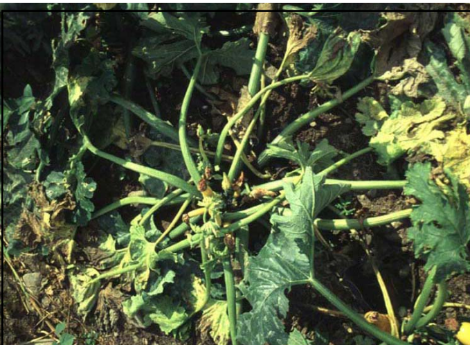
Figure 1: Symptoms of yellowing, wilting and dieback of the foliage of squash

Symptoms of the disease first appear on a single leaf which suddenly wilts and becomes dull green (Fig.1.). The wilting symptoms spread up and down the runner sometimes as a recurring wilt on hot, dry days. Soon infected runners and leaves turn brown and die. The bacteria spread through the xylem vessels of the infected runner to the main stem, then to other