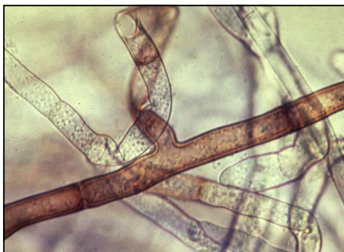
Figure 2: Microscopic view of Rhizoctonia sp. mycelium.

Cool season grasses that are cut higher produce small light brown patches up to 15 cm in diameter that may or may not contain the diagnostic smoke-ring symptom. Cool season grasses that are cut high and kept dry may produce patches up to 30 cm in diameter. These patches may develop a symptom known as a "frog eye". Frog eye patches have apparently healthy green grass that is surrounded by a ring of necrotic grass that appears very flat and sunken into the ground.