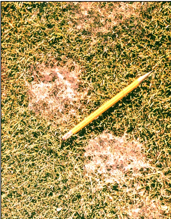
Figure 1: Infected spots on turf.

Winter diseases of turfgrasses are often associated with melting snow or cold, wet periods. Bluegrasses ( Poa spp.), fescues ( Festuca spp.), and ryegrasses ( Lolium spp.) may be attacked, but bentgrasses ( Agrostis spp.) are most susceptible. Two diseases, Gray Snow Mold (Typhula blight) and Pink Snow Mold , are common in New York, and may occur singly or side-by-side. Since different fungicides may be used to control each of these diseases, it is necessary to distinguish between them.