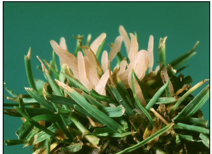
Figure 2: Clavula of sporocarps in close-up view of infected turf.

Gray snow mold (Typhula blight) is caused by Typhula incarnata and related species. It is a true snow mold and appears as roughly circular bleached patches up to 60 cm in diameter ( Fig. 1 ). Soon after the snow melts, the infected grass may be matted and surrounded by a white to gray halo of fluffy fungal growth. Examination of the diseased plants reveals tiny tan or brown pea-like structures (sclerotia) on, or imbedded in, infected leaves. The severity of the disease will vary. It may be particularly severe when turf has been subjected to a prolonged, deep, compacted snow cover. Although the disease is unsightly, it rarely kills the grass.