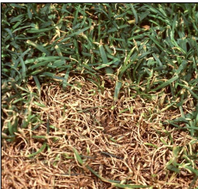
Figure 1: Symptoms of Anthracnose on turfgrass.

The pattern of symptoms depends largely on weather conditions. Rotting of the basal stem is the most prevalent symptom detected during cool, wet weather. Water-soaked stem lesions become dark in color, and the leaf blades eventually yellow and die (Fig. 1). The central stem can be pulled from the plant quite easily revealing a blackened base.