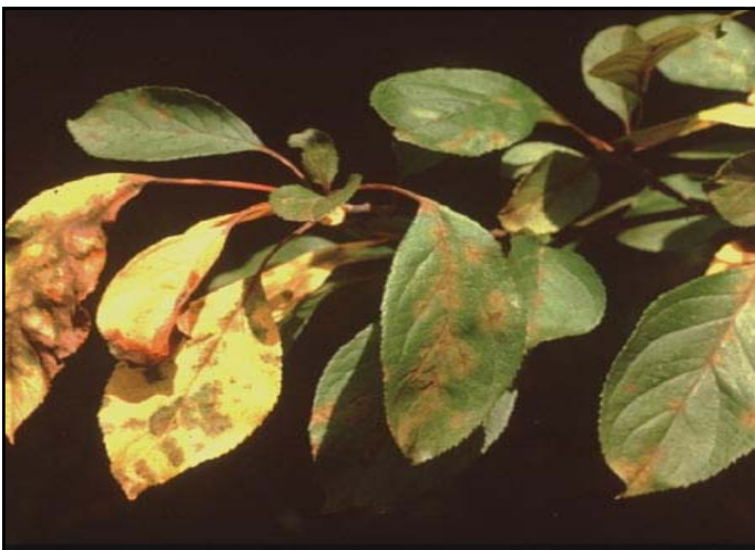
Figure 1: Scab symptoms on leaves.

The disease may affect leaves, petioles, pedicels, fruit and twigs. The symptomatic spots are most noticeable on leaves and fruit. Infections first appear as olive-green spots with indefinite borders. With age, these spots become more prominent and darken to greenish-black with a velvety appearance (Fig.1). Severe spotting will cause leaves to senesce and fall off. Spots on young fruit result in deformation and cracking (Fig. 2). If infection is severe, the fruit may drop off before ripening.