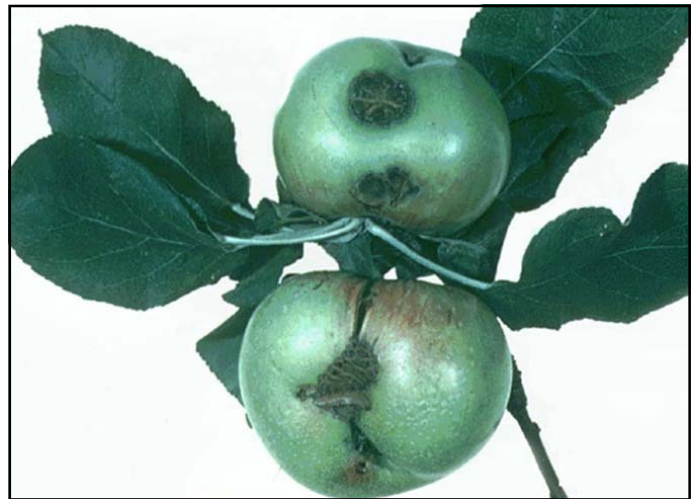
Figure 2: Apple fruits showing scab symptoms.

Defoliation may result in a reduction of flower bud formation so that bloom or fruit yield the next year will be reduced.