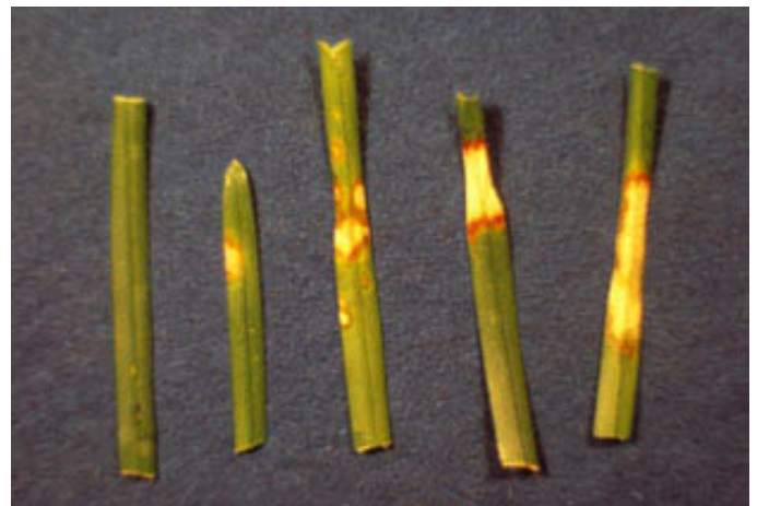
Figure 2: Disease symptoms on individual blades (provided by Dr. Eric B. Nelson, Cornell University)

With higher cutting heights, the bleached turf spots are irregularly shaped. In the early morning, when dew is still on the grass, a white cobwebby growth of the fungus may be seen over the spot. Spots coalesce to cover large areas when the disease becomes severe. On individual grass blades the damaged tissues are first water-soaked and dark colored. As they dry, the lesions turn light tan to straw-colored with a reddish-brown border (Fig. 2). The lesions first occur randomly on the leaf blade, and then frequently extend across the entire blade. Older lesions may become quite long and cause blighting of the entire leaf or cut leaf end.