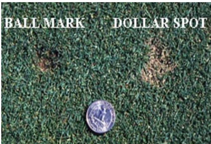
Figure 1: Physical damage of a ball mark vs. symptoms of dollar spot

The pattern of symptoms depends largely on mowing practices. Under close mowing conditions the circular straw-colored spots (3 to 6 cm in diameter) are distinctly outlined in the early stages of disease development (Fig. 1).