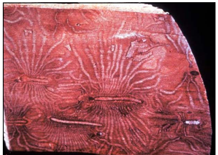
Figure 2: Bark beetle galleries.

Symptoms develop quickly within a 4-5 week period and usually when the leaves have reached full size. The first visual symptom usually observed within the crown of the tree is referred to as "flagging". This occurs when one or more branches develop symptoms of wilting and/or yellowing of the leaves on a otherwise apparently healthy tree. Prior to this occurring, symptoms have developed internally and include the death of xylem cells, the loss of water conducting ability, and the browning of the infected sapwood in narrow streaks that follow the wood grain (Fig. 1). The fungus is present in the streaked wood, and isolations taken from this symptomatic tissue are needed to confirm infection by this pathogen. Occlusion of xylem vessels is due to the production of gums and tyloses. In the Western U.S. where summers are dry, water shortage and heat stress often mask symptoms.