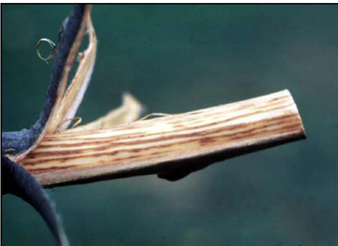
Figure 1: Characteristic streaking seen beneath the bark.

Prior to the arrival of this pathogen, many streets and parks were graced by the upright and spreading branch structure of American Elms. The appearance of a mature American Elm can make nature lovers stop and stare in awe. Due to the incredible interest in these trees, plant breeders have been trying to develop resistant American Elms for years. Unfortunately, many of those trees proved to be susceptible to other diseases such as Elm Yellows.