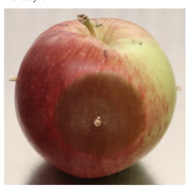
Figure 1: A diseased Fuji apple 2 weeks post-inoculation via infected toothpick (in the center of the brown lesion)

Paecilomyces rot is similar to and may be misdiagnosed as a handful of other diseases: Lesions caused by Bull's eye rot (Neofabraea spp., synonym Cryptosporiopsis spp.) are similar but more sunken than those caused by Paecilomyces rot. Bull's eye rot lesions may also be dotted with creamcolored acervuli. Blue mold (Penicillium spp.) produces blue-green spore masses on the fruit surface, and a soft, watery (not firm) rot of tissues. Gray mold ( Botrytis cinerea ) typically covers fruit with gray-brown sporulation, in contrast to the very sparse white mycelium at lenticels of Paecilomyces rot. Gray mold lacks a detectable odor. Mucor rot (Mucor spp.) produces a watery tissue rot, and characteristic "pinhead" sporangia on the surface of the lesion. Sphaeropsis rot (Sphaeropsis pyriputrescens) is distinctive for its black pycnidia in decayed areas. The disease usually occurs near the stem or calyx.