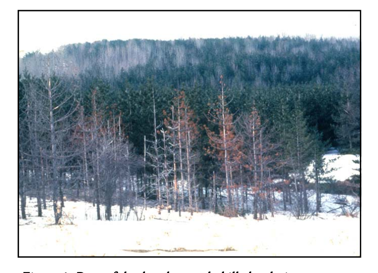
Figure 1: Row of dead and recently killed red pine

Red or Norway pine ( Pinus resinosa ) is a favored timber tree in the northeast and north central states. It grows rapidly, has a straight, clear trunk, and seems to thrive on a variety of soils. In addition the species has few serious insect and disease pests. Because of this, red pine is as popular for shade and ornamental purposes as it is for reforestation. Unfortunately, as more trees have been planted in increasingly diverse sites, unforeseen problems in cultivation of red pine have become apparent.