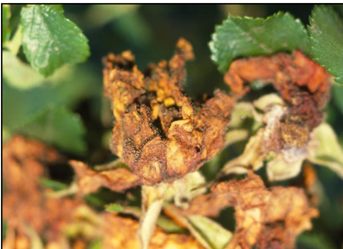
Figure 1: Rose affected by botrytis blight.

During wet or humid weather, examine any brown or spotted plant material that develops, and look for masses of silver-gray spores on the dead or dying tissue. These spores are readily liberated, and may appear as a dust coming off of heavily infected plant material. Some species of Botrytis form tiny black resting structures called sclerotia that may be evident on dead plant tissue in late summer. Not all species of Botrytis readily form these, so they may not be observed on all plants.