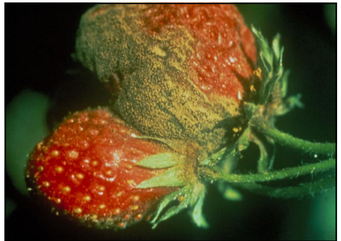
Figure 2: Botrytis on strawberries

Among vegetables and fruit, B. cinerea can infect asparagus, bean, beet, carrot, celery, chicory, crucifers, cucurbits, eggplant, endive, grape, lettuce, onion, pepper, potato, raspberry, rhubarb, rutabaga, shallot, strawberry, tomato, turnip, and others. Refer to Table 1 for further details on how botrytis blight affects certain kinds of plants.