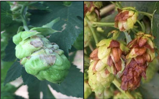
Figure 4: (L) Powdery mildew infected hop cone. (R) Brown discoloration of hop cone bracteoles with severe downy mildew.

the tip of the cone and within each of the bracteoles. These colonies will eventually cause brown, necrotic lesions on the hop cones. Additionally, infected cones are commonly physically distorted and growth is typically stunted from the point of infection and thereafter. Infected cones have distorted alpha and beta acid content, disturbing the essential components of hops for brewing purposes.