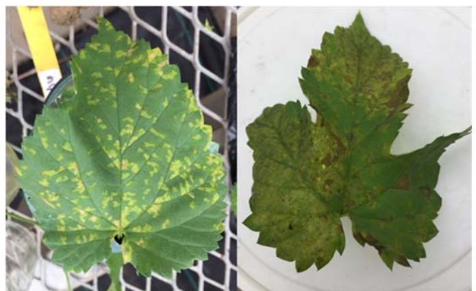
Figures 2: Typical foliar signs and symptoms of Downy Mildew. (L) Yellow lesions on upper leaf, typical early symptom. (R) Brown necrotic lesions, typical later stage symptom. (B. Weldon)

Powdery mildew can occur on all green tissue of the hop bine, including the stems, leaves, flowers, and hop cones. The most telling sign of the pathogen is white, powdery colonies that can be found on either side of leaf tissue, as well all other plant parts. Infections on the underside of the leaf are also possible, and the host plant usually expresses chlorotic spots on the corresponding topside of the leaf as a symptom.