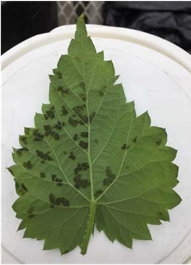
Figure 3: Black masses of sporulation found exclusively on underside of leaf. (B. Weldon)

As colonies age, they develop a grey, granular appearance, which over time can develop into a necrotic lesion on the leaf. Infected cones also contain the characteristic white powdery colonies at