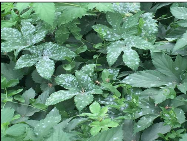
Figure 1: Characteristic white colonies of hop powdery mildew. (B. Weldon)

As hop yards re-emerge to meet these demands, it is important to recognize that the pathogens that destroyed the industry of the 20 th century are still present, and must be managed to ensure a stable hop industry. This fact sheet highlights Downy Mildew and Powdery Mildew, with the intention of aiding diagnosis and management of these pathogens.