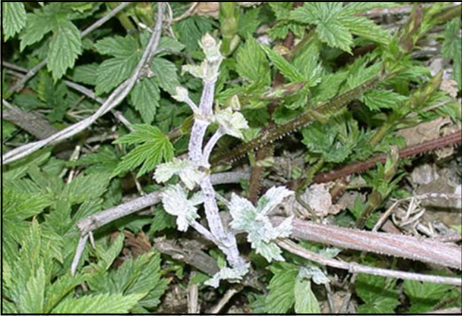
Figure 6: Hop powdery mildew flag shoot. (D.H. Gent)

making the pathogen destructive even in dry climates and dry years.