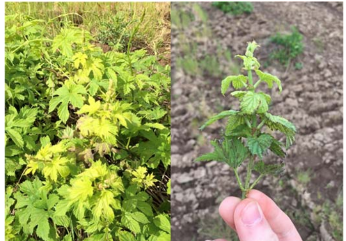
Figure 5: Downy mildew basal spikes. (L) A cluster of basal spikes emerging from the hop plant. (R) A single basal spike pulled from a downy mildew infected hop plant. Note the shortened internodes between leaves, chlorotic tip of the shoot, and downward curling leaves.

quickly develop from chlorotic, water soaked spots to necrotic lesions that readily desiccate in dry conditions.